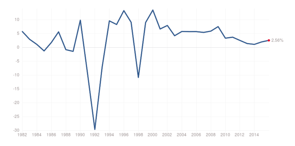
Graph 5.1. Albania GDP growth rate per year

In Albania, the increase of public debt was mainly due to the need of funding public investments, focused on infrastructure.