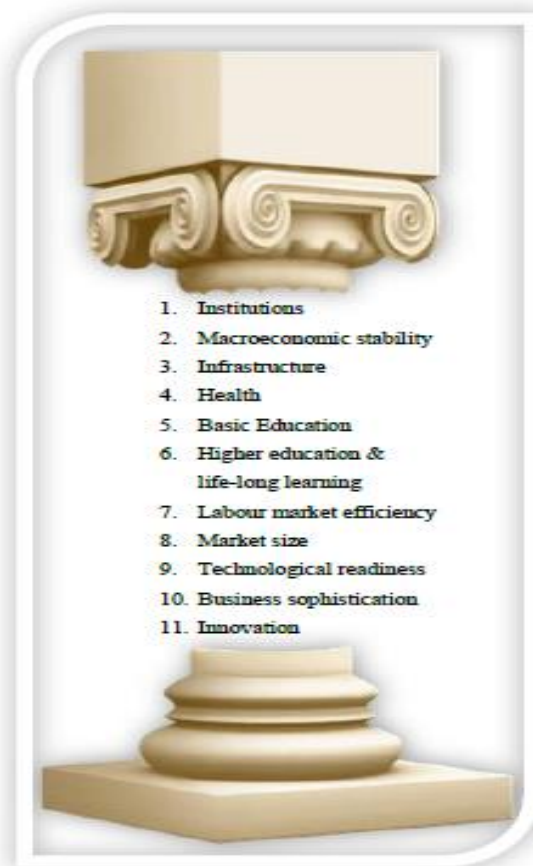
Figure 1. The main pillars of RCI

Thus, institutional set-up and decision-making is analyzed taking into account a set of 17 indicators for regional and national institutions, as follows: corruption; quality and accountability; impartiality; political stability; government effectiveness; regulatory quality; rule of law; control of corruption; easy of doing business; property rights; intellectual property protection; efficiency of legal framework in settling disputes; efficiency of legal framework in challenging regulations; transparency of government policymaking; business costs of crime and violence; organized crime; reability of policy services.