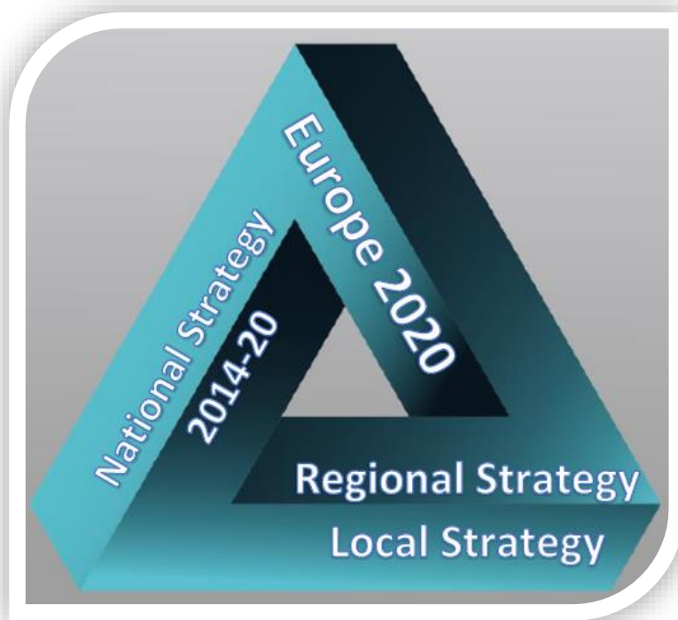
Figure 3. Integrative strategic thinking

account when designing regional strategies, and furthermore, all of them should be reflected in the national strategy for development. Moreover, this last document should connect the national needs of development with the European perspective.